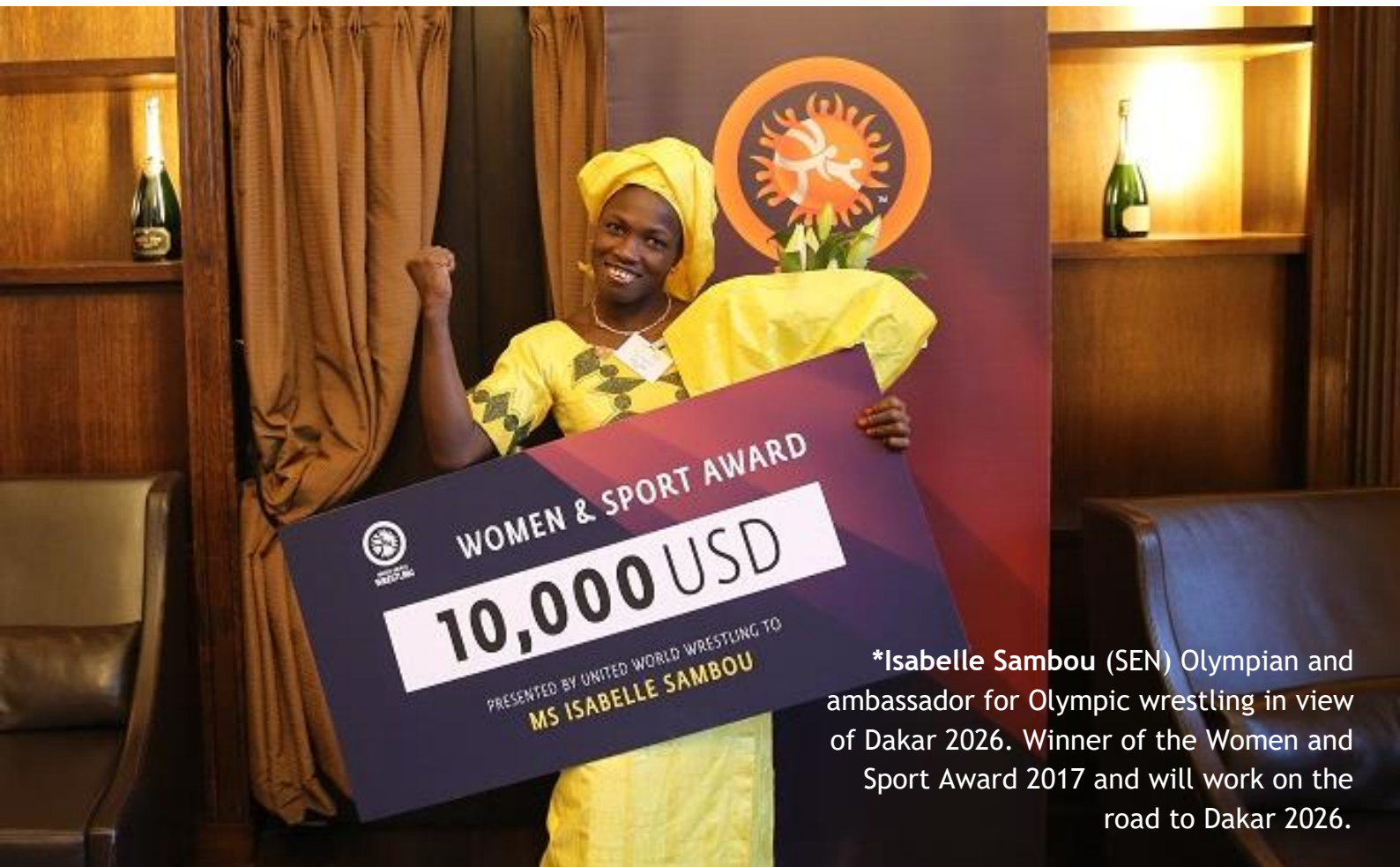
*Isabelle Sambou (SEN) Olympian and ambassador for Olympic wrestling in view of Dakar 2026. Winner of the Women and Sport Award 2017 and will work on the road to Dakar 2026.